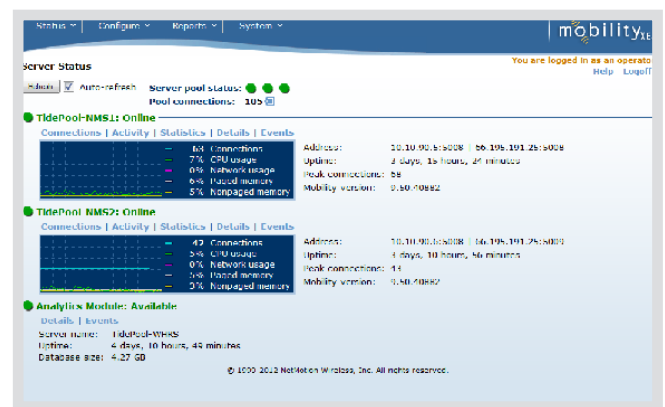
Mobility XE 9.5 ships with an updated interface that is easier to navigate and configure